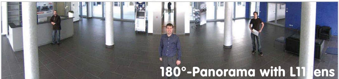
180°-Panorama with L11 lens

The M24M series from MOBOTIX offers extremely compact, cost-effective and exceptionally powerful allround cameras with the widest range of lenses, including panorama version. Fully equipped with IP66-certified housing and long-term internal storage on a MicroSD card!