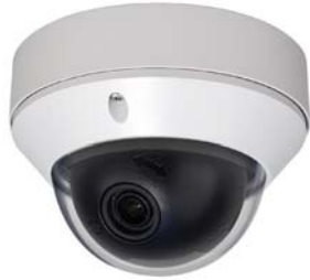
Flush Housing with Surface Mount